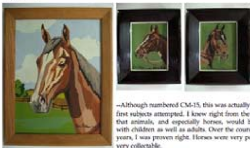
CM-15- Spirited Stallion 12x16, 4x5.5

--Although numbered CM-15, this was actually one of the first subjects attempted. I knew right from the beginning that animals, and especially horses, would be popular with children as well as adults. Over the course of many years, I was proven right. Horses were very popular and very collectable.