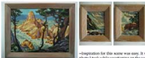
CM-13- Beach, Surf and Sky 16x12, 4x5.5

--Inspiration for this scene was easy. It was from a photo I took while vacationing on the west coast.