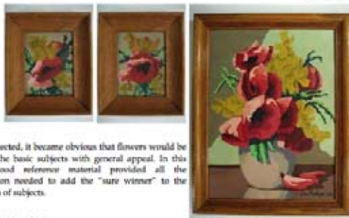
CM-14- Poppies in Composition 12x16, 4x5.5

--As expected, it became obvious that flowers would be one of the basic subjects with general appeal. In this case, good reference material provided all the inspiration needed to add the "sure winner" to the selection of subjects.